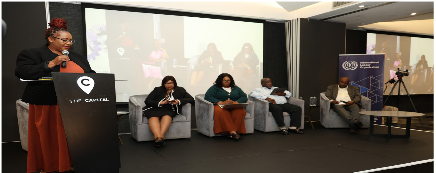
Day 2 of the ILO “Productivity Ecosystems for Decent Work” National Symposium reinforces a central message: productivity growth and decent work must go hand in hand to drive inclusive and sustainable development in South Africa.