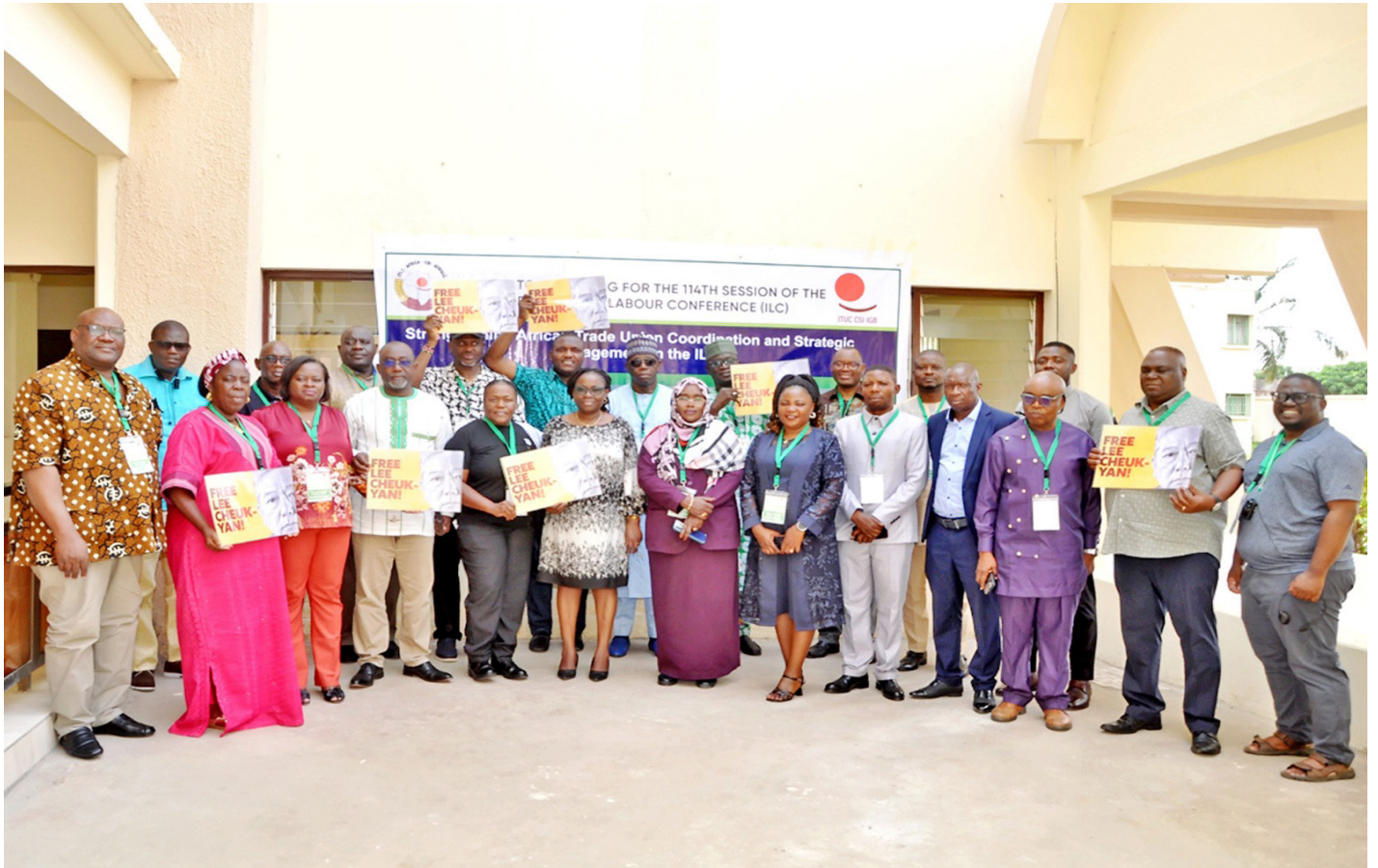
Africa Pre-ILC Meeting, Lomé, Togo | 16–17 March 2026.

The ITUC-Africa and the ITUC convened a preparatory meeting in Lomé, Togo, ahead of the 114th International Labour Conference (ILC), which will be held in June in Geneva.