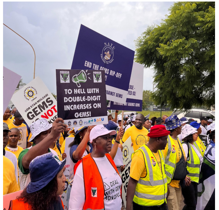
National Day of Action against GEMS, held on 21 February 2026 in Pretoria.