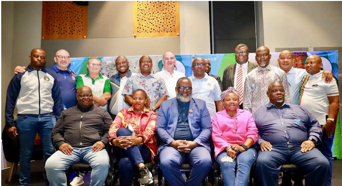
Delegates at the PSCBC Strategic Planning Session.