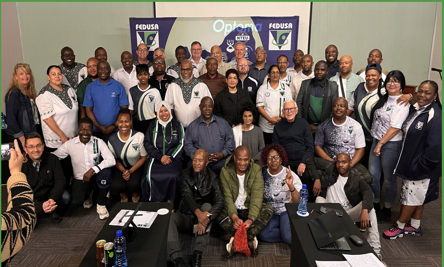
FEDUSA Bosberaad 2025, Pretoria