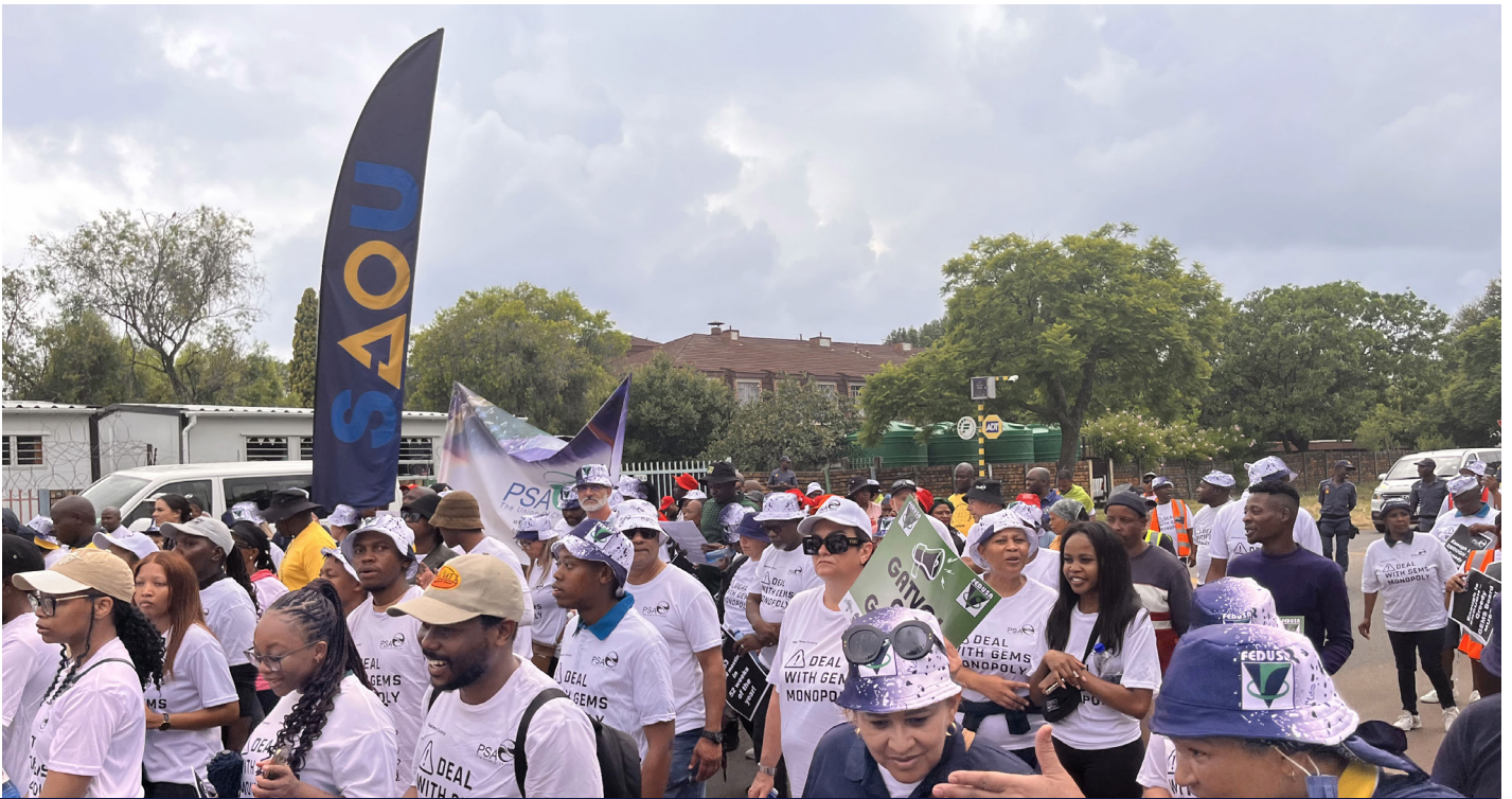
Public service workers march to the GEMS offices in Menlyn, Pretoria.