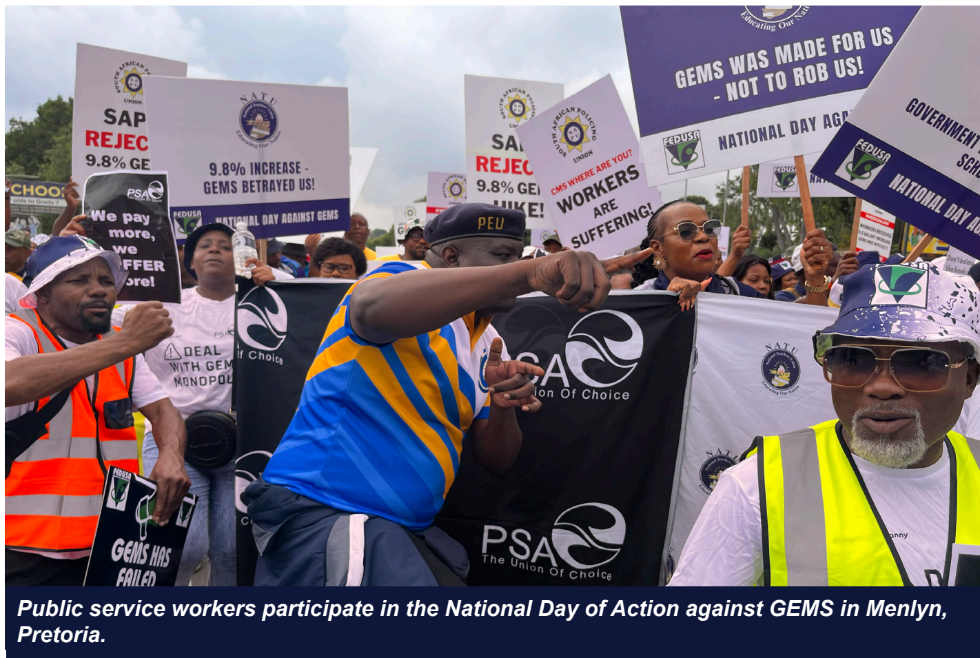
Public service workers participate in the National Day of Action against GEMS in Menlyn, Pretoria.