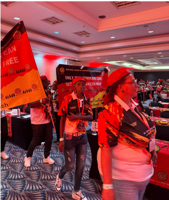
Members at the NULAW Congress celebrate the union's 100th anniversary.

The National Union of Leather and Allied Workers (NULAW) held its congress in conjunction with its 100th anniversary, during which new leadership was elected.