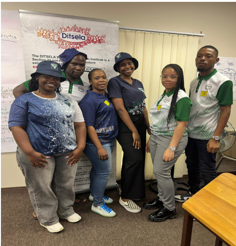
FEDUSA delegation attends a four-day training programme hosted by Ditsela, aimed at enhancing administrative skills.